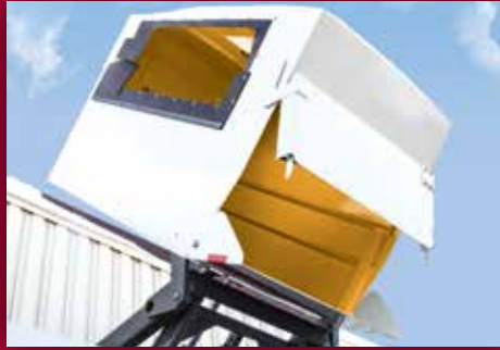
LIFELINER® HOPPER SYSTEM The LifeLiner® hopper system is a specially designed hopper liner and finish system that greatly improves the life, durability, and functionality of a sweeper hopper. The LifeLiner hopper system is backed by a lifetime warranty.*