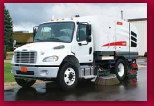
CONVENTIONAL CHASSIS Conventional chassis are built for sweeping and provide outstanding visibility, comfort, safety, and productivity. The short wheel base and unique steering geometry allow maximum maneuverability. A choice of Freightliner or International conventional chassis are also available.